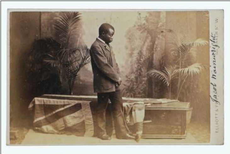
A rare photograph from the funeral of Victorian explorer Dr David Livingstone (1813-1873).

STANSTED MOUNTFITCHET, UK — A rare photograph from the funeral of Victorian explorer Dr David Livingstone (1813-73) comes to auction in Essex this summer. The carte de visite, showing Livingstone's coffin attended by his faithful African servant Jacob Wainwright, is expected to sell for £600/900 as part of Sworders' Out of the Ordinary sale in Stansted Mountfitchet on August 19.